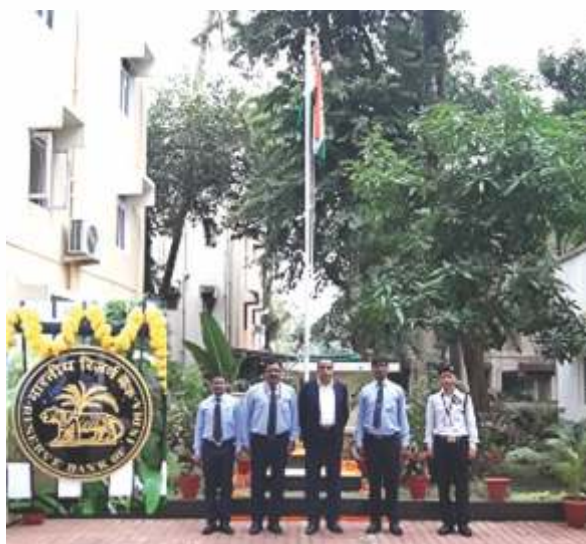
Reserve Bank of India Panjim, Goa