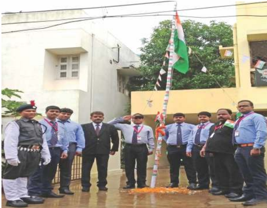
Flag Hoisting at BIS Branch Office