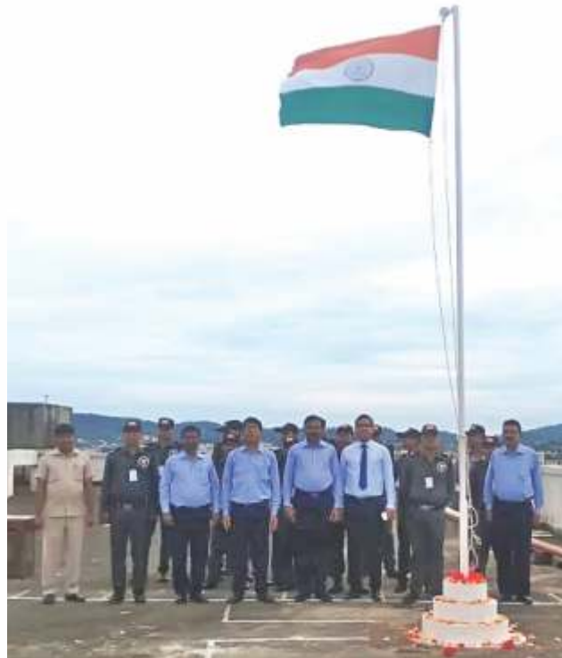
The national festival was also celebrated at the State Bank of India, Zonal Office.