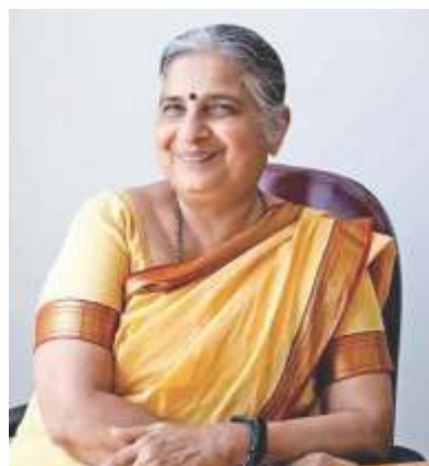
Mrs. Sudha Murthy

We began chatting amicably. I decided to use the opportunity to ask some questions.