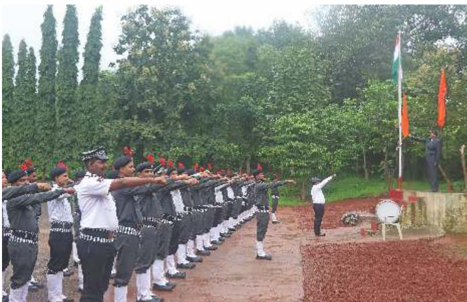
Oath of allegiance to the Sovereignty of our Nation.