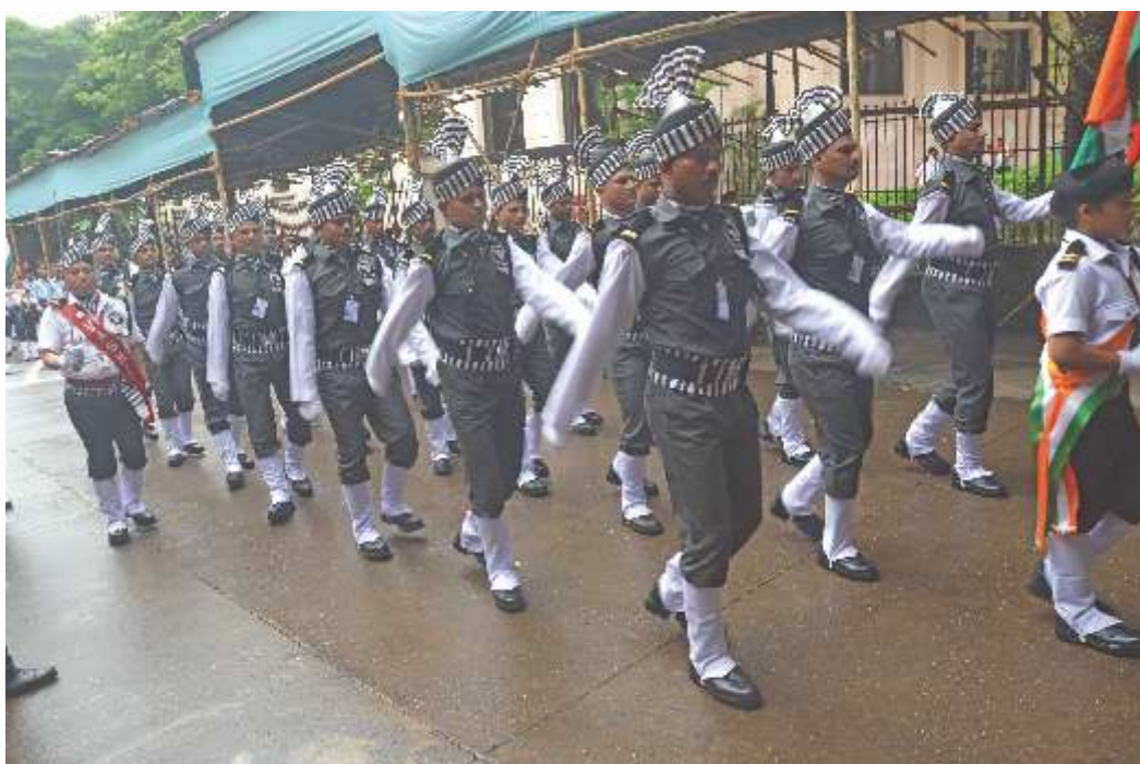
Parade by guards of Vashi Branch