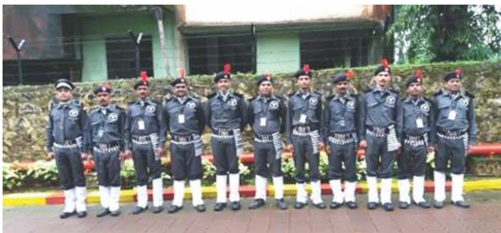
Associated Cables Pvt. Ltd. Chiplun, Maharashtra