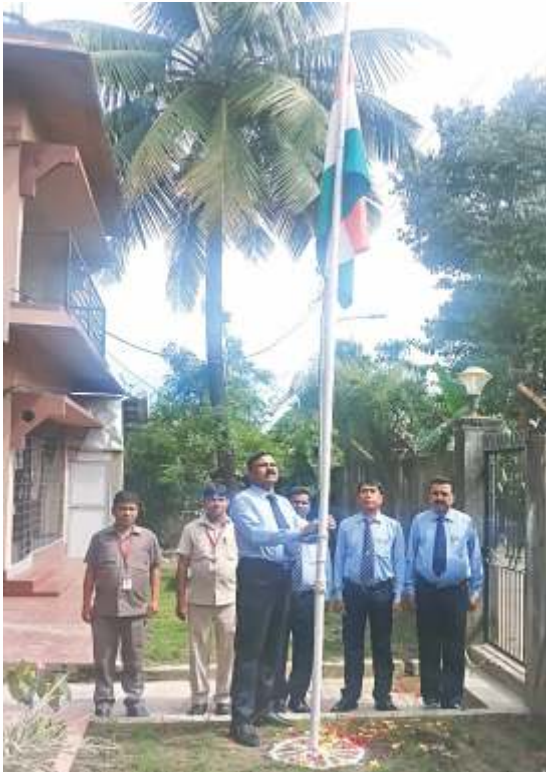
The National Flag was hoisted at our branch office in Guwahati.