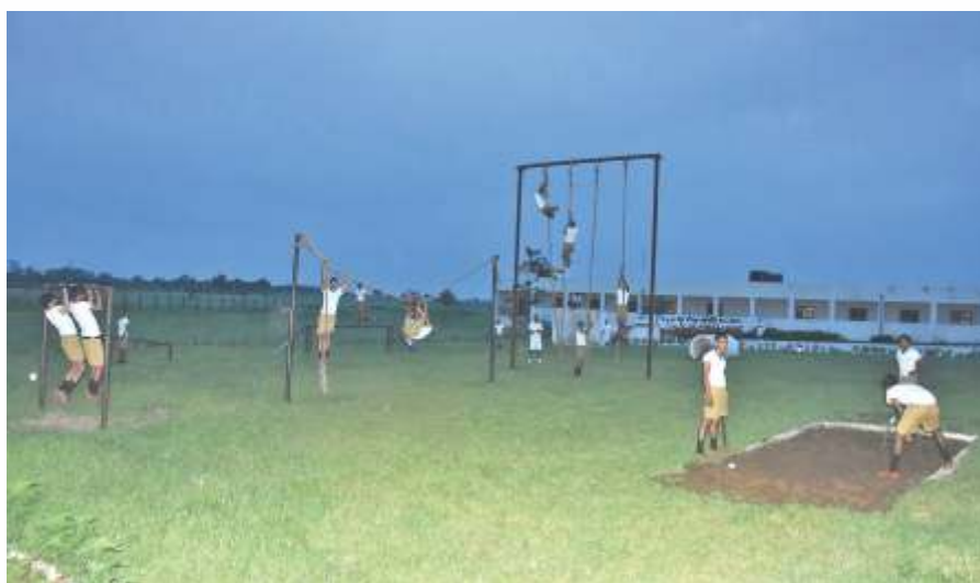
Obstacle course training was given to trainees during training session.

Though it is unarmed training syllabus, however basic handling of fire gun and pistol is given to each trainee, so that they should have basic knowledge of fire arms. All trainees practiced on all three positions like- Standing Position, Kneeling Position and Laying Position.