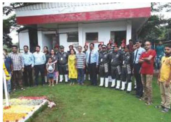
Funskool (India) Ltd. Corlim, Goa