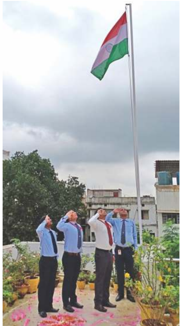
The office staff is seen here saluting the National Flag in our Ranchi branch office.