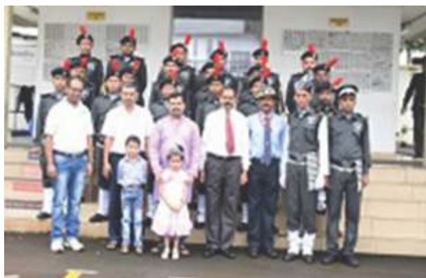
Colgate Palmolive Ltd. Kundaim, Goa