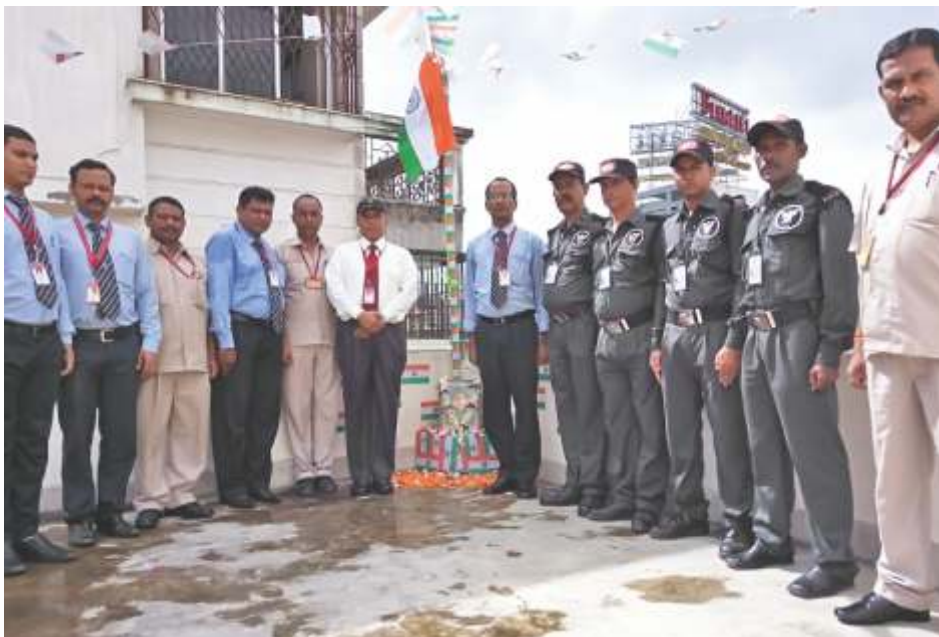
Independence Day was celebrated at our Kolkata Branch with flag hoisting and national anthem.