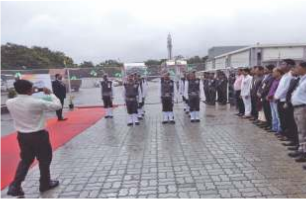
Independence Day Celebration at Bosch Chassis System India Pvt. Ltd, Chakan, Pune on 15 Aug 2018.