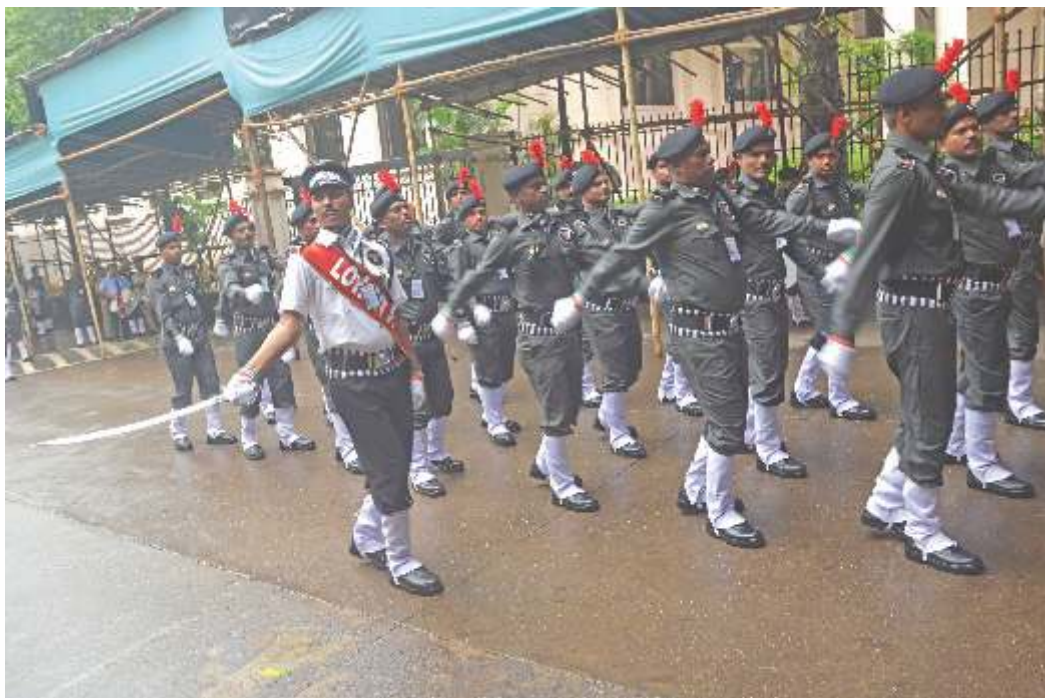
Parade by guards of Lower Parel Branch