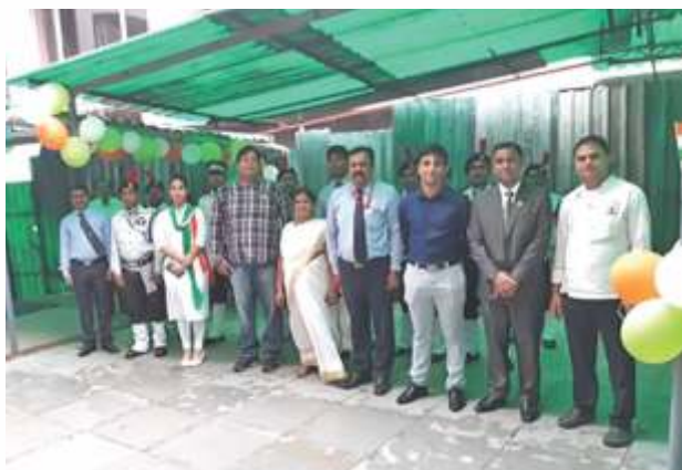
Hotel Fidalgo, Panjim, Goa